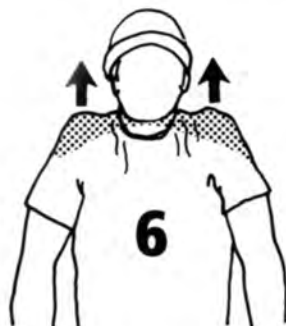
5 seconds 2 times (page 46)