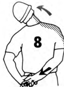
8-10 seconds each side 2 times (page 47)