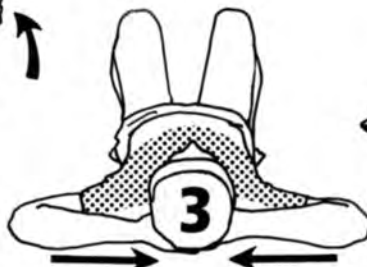
5-6 seconds 2 times (page 28)