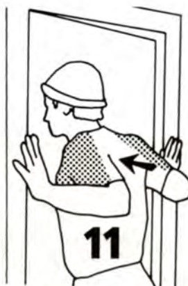
15-20 seconds (page 47)