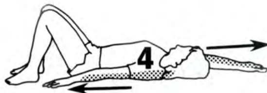
8-10 seconds each side (page 29)