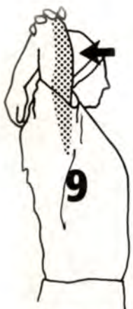
15 seconds each arm 2 times (page 44)