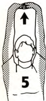
10 seconds 2 times (page 46)