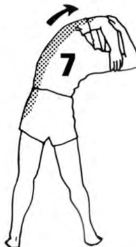
8-10 seconds each side (page 44)