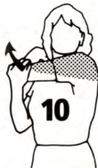
15-20 seconds each arm (page 43)